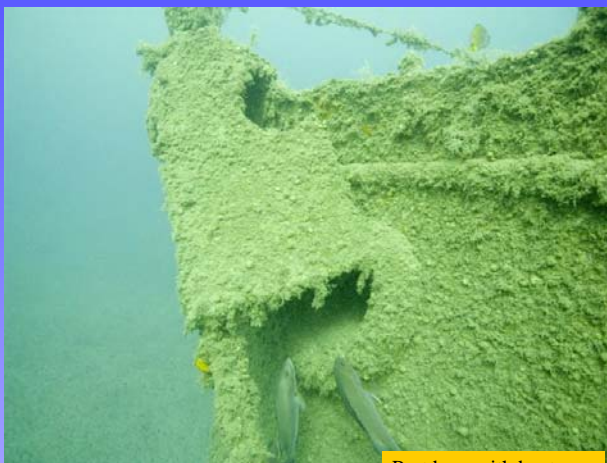
Port bow with bent plate and anchor hole.

Photographical recording in order to help determine more easy some parts of the ship and to monitor the present condition of the wreck.